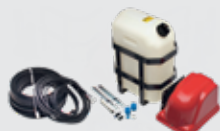
A5200052 FOAM MARKER